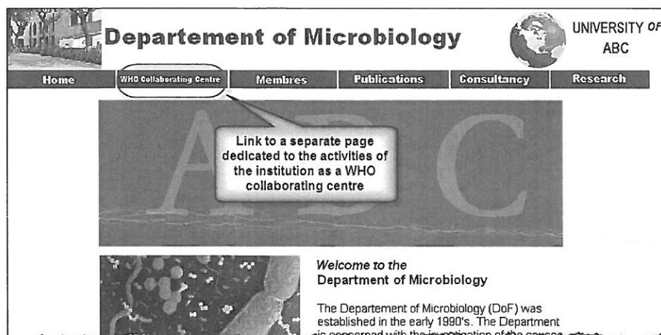
Example above: main page of the Department of Microbiology of the University ABC.

Example below: page within the web site of the Department of Microbiology of the University ABC, especially dedicated to the activities in its capacity as a WHO CC for Diphtheria and Streptococcal Infections.